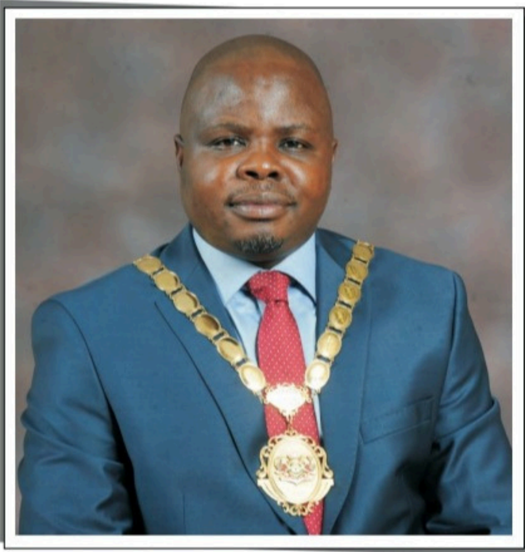
Executive Mayor Cllr Pule Shayi