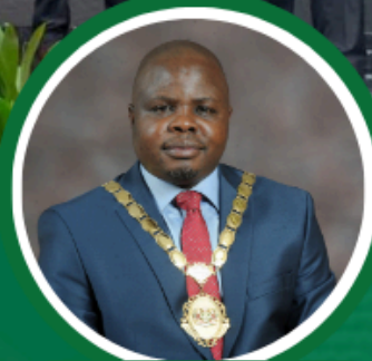
Executive Mayor Cllr Pule Shayi