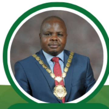
Executive Mayor Cllr Pule Shayi