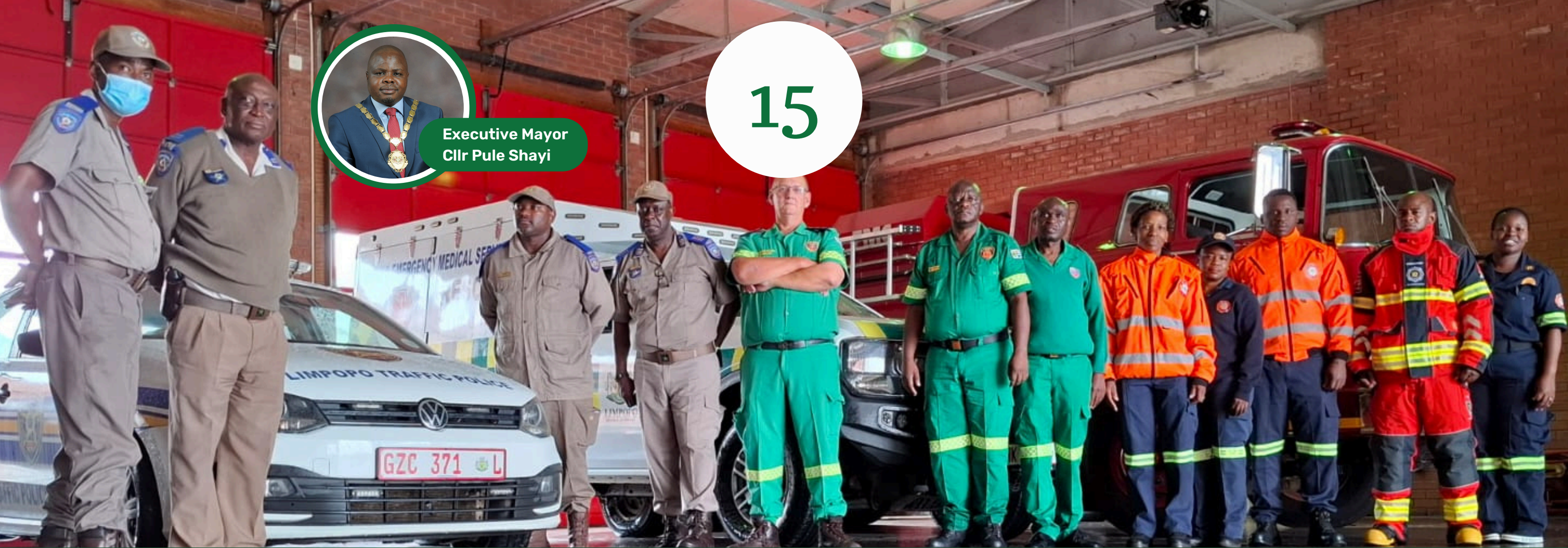
Executive Mayor Cllr Pule Shayi